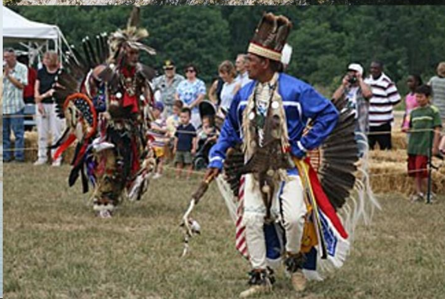
Patuxent Encounters event at Jefferson Patterson Park and Museum, 2007