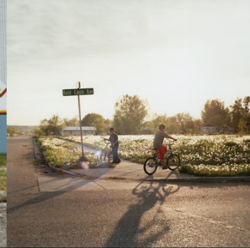
2 boys riding their bikes in Sioux Village on the Standing Rock reservation.