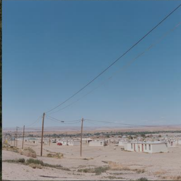
Shiprock, a town on the Navajo reservation in New Mexico